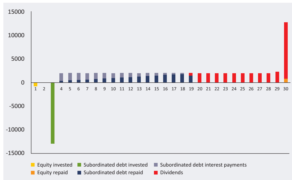
Figure 1: Cash flow allocation for a generic PFI scheme with equity draw down (£000). 8